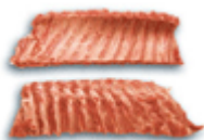
Loin ribs, wide cuts